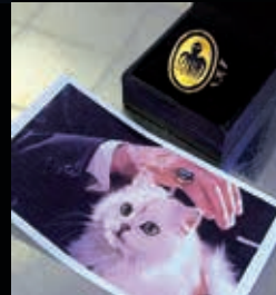
Spectra's ring 14 carat gold