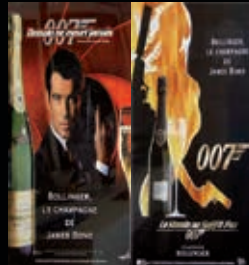
Poster Bollinger Champagne