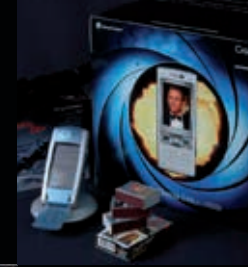
Telephones Sony Ericsson