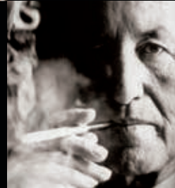
The writer Ian Fleming