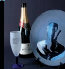
007 designed glass