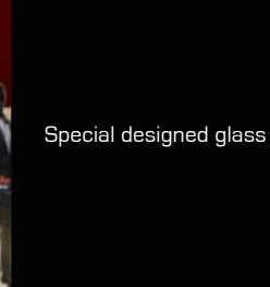
Special designed glass