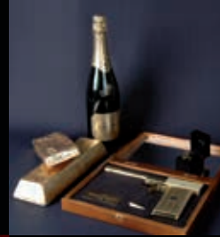
Golden gun "The Man with the Golden gun"