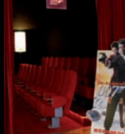
James Bond cinema