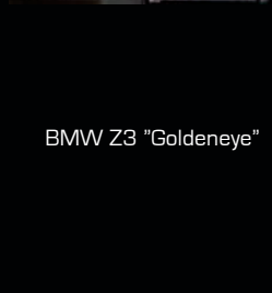
BMW Z3 "Goldeneye"